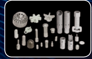
PARTS & SERVICE