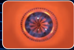
GLSF Ultra-Low NO x Free-Jet Boiler Burner