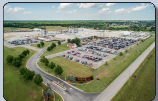
ZEECO Headquarters on 250 acres (1 km 2 )

We are confident you will thoroughly enjoy the many advantages of working with the flexible, innovative company that is Zeeco. Call or e-mail us today to request a quote or to learn more about our proprietary combustion systems.