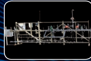
Fuel Valve Train System