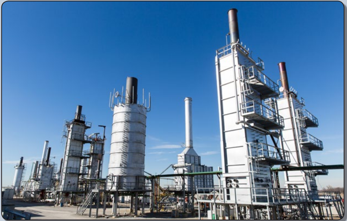
ZEECO Combustion Research and Test Facility

Zeeco is the worldwide leader in combustion and environmental solutions. We are a privately held company with more than 20 global locations and thousands of installations to our name. Our Combustion Research and Test Facility is the largest and first in the world to become ISO 9001-2000 certified. With 21 test units (15 furnaces and 6 flares), Zeeco is capable of testing a wide variety of combustion systems under simulated field conditions.