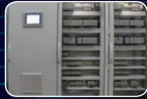
Burner Management System Enclosure